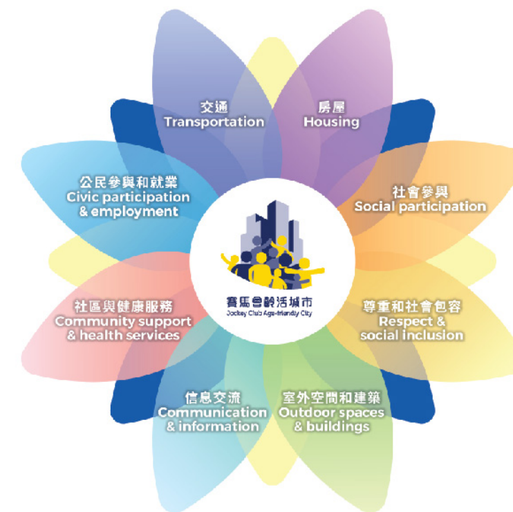
世衛確認「長者及年齡友善城市」的八大範疇 The eight domains of an age-friendly city identified by WHO

Through the Jockey Club Age-friendly City Project, the Trust aims to promote age-friendly culture in Hong Kong, encourage the public to be aware of the needs of people of different ages, and drive mindset changes towards "ageing". The Trust joins hands with various stakeholders to build Hong Kong into an age-friendly city which can cater for the needs of all ages.